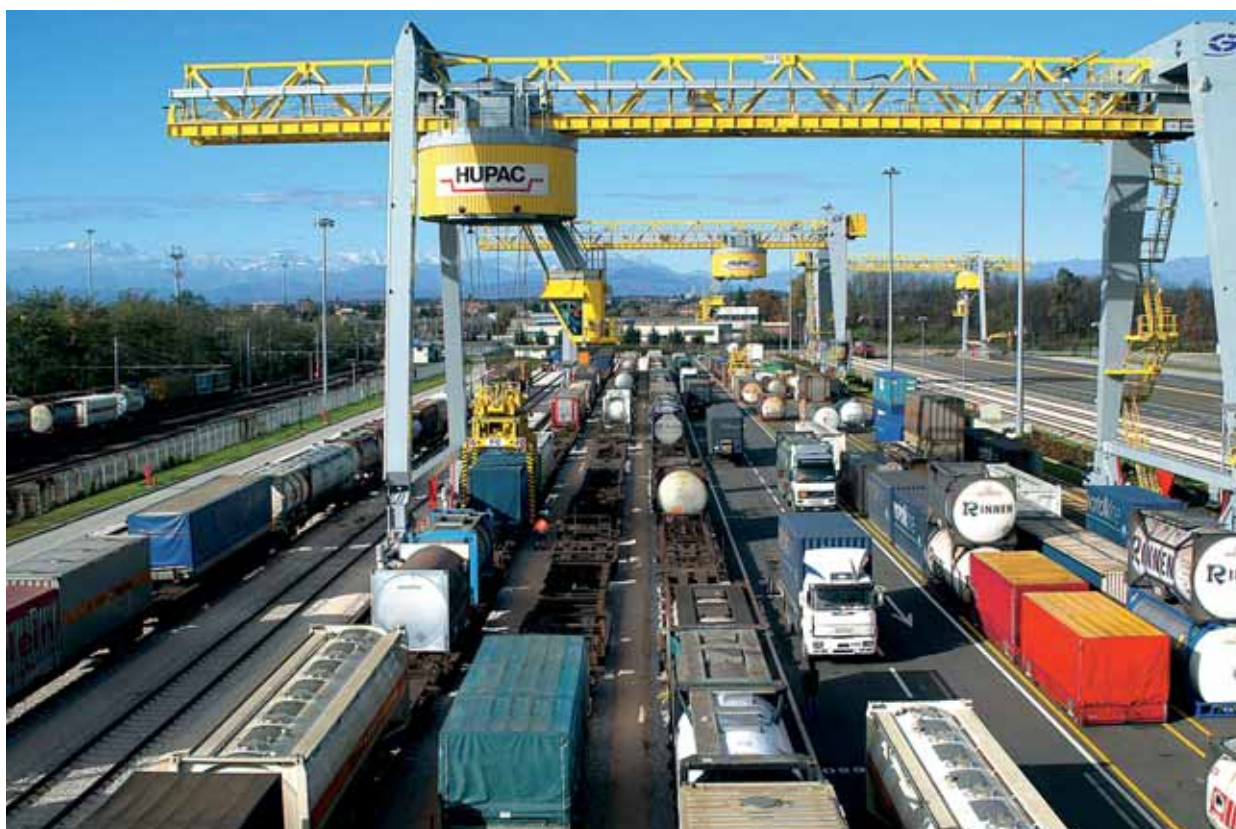
Whenever it is reasonable, freight forwarders are already using combined rail-road transports.

New materials handling and warehouse technologies can also increase efficiency significantly. As far as possible, all logistics process modules must be designed as standardised and exchangeable. They should no longer be tied into a rigid process chain but assembled flexibly using automatic controls that take account of the task they have to perform. This will require intelligent software, which also allows optimised route planning when dovetailing deliveries for a number of companies. For example, the joint research project with the cryptic name “SOA4LOG” at the Technical University of Berlin is already successfully working on a “service oriented application platform for logistics” of this type. The future has already begun. ◀