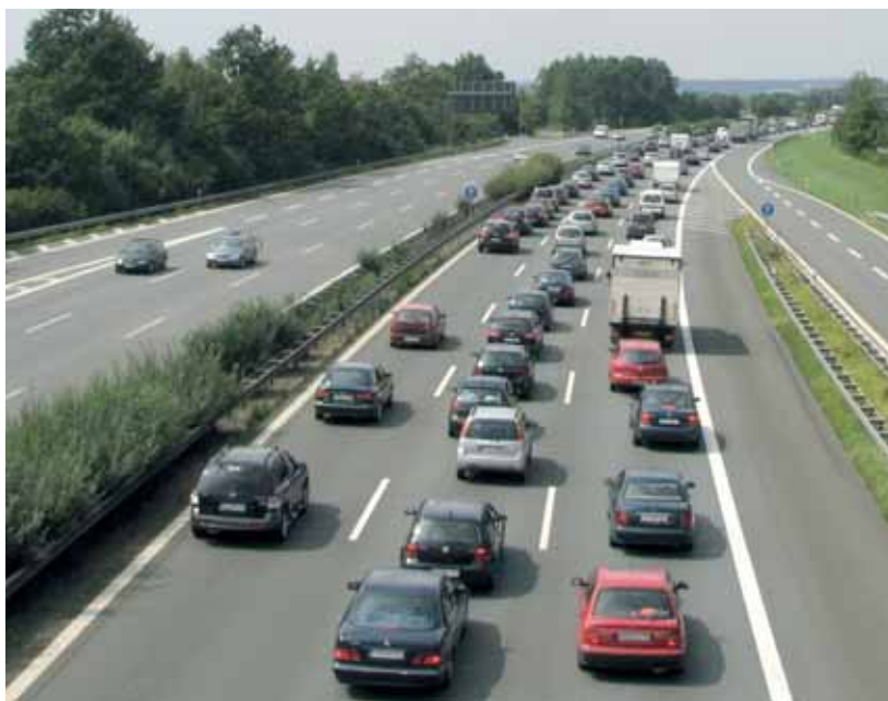
Extraordinary vision or simply common sense: The “Freight Transport and Logistics Masterplan” proposes to open the hard shoulder to trucks.

port, Wolfgang Tiefensee (SPD), admitted according to the magazine “Der Spiegel”: “The growth rates for traffic have simply thrown overboard all the forecasts made in the 90s.” In the view of the news magazine, the Federal Transport Infrastructure Plan has “long become an emergency document”. And the new “Freight Transport and Logistics Masterplan” passed in July this year with its 35 measures for faster completion of roadworks, opening of the hard shoulder and more flexible road charges is already suffering a similar fate. “In years to come, it is unlikely that this document will be remembered for its far-sightedness and creativity,” is the opinion of logistics expert Prof. Wolf-Rüdiger Bretzke. At the same time he criticises the industry’s own out-of-date logistics concepts. He says it is “ghastly when ‘Just-in-Time’ models and ‘One-Piece-Flow’ concepts are held up in the logistics sector as models of intelligent process design.”