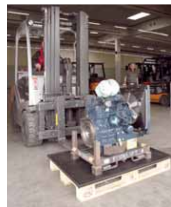
Non-slip mats prevent shipments from moving where they are not supposed to.

It comes as no surprise that Marotech also pays close attention to the quality and safety of its transport service providers. “John Spedition’s customers have the feeling they are in safe hands,” is the judgement from Marotech. If there were guidelines for customer satisfaction, John Spedition would certainly meet them. www.lasiportal.de , www.marotech.eu , www.marotech.de ◀