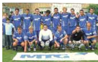
Winning team MTG Mannheim stole the UEFA EURO’s participants’ thunder

CargoLine partner Wackler Göppingen was responsible for the outstand-