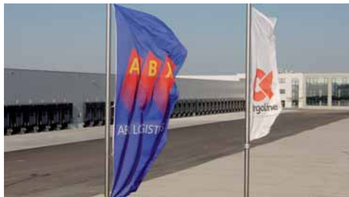
The new ABX terminal in Lahr

► Spedition Sander is setting the pace in the quiet, North German state of Mecklenburg-Western Pomerania. The CargoLine partner based in Rostock has completed the expansion of its cargo handling hall from 2,500 sqm to 4,000 sqm. With an increased total of 42 loading gates, trucks can now be loaded more than one hour faster than was previously possible. And there's