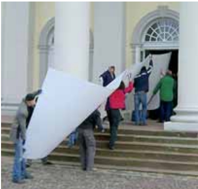
It took fifteen people to handle each of the flexible polycarbonate sheets.

The whole transport was conducted under the greatest secrecy – the ABX employees