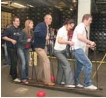
Seven out of more than 1,500 Cargolympics participants.

► On May 5, approx. 1,500 CargoLiners competed in the first ever CargoLympics at the Brinkhoff brewery in Dortmund. The partner companies and system headquarters had invited their staff to this “It’s A Knockout” competition to say thank you for their exceptional dedication and commitment in the boom year of 2006. Altogether, competitors skied a total of 100,000 centimetres on summer skis, scored 418 goals in “human table soccer”, threw rubber boots 19.62 kilometres, transported 48.5 litres of water on stilts and guided 400 balls to their destination through temporary water pipes. The teams competed for sections of a jigsaw puzzle in each dis-